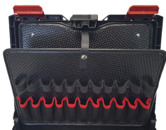
HAND TOOL PANEL