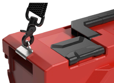
CARRYING BELT CONNECTS TO ANY META BOX CASE