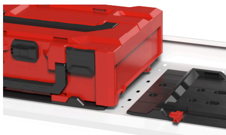
UNIVERSAL ADAPTERPLATE FOR ANY SHELF